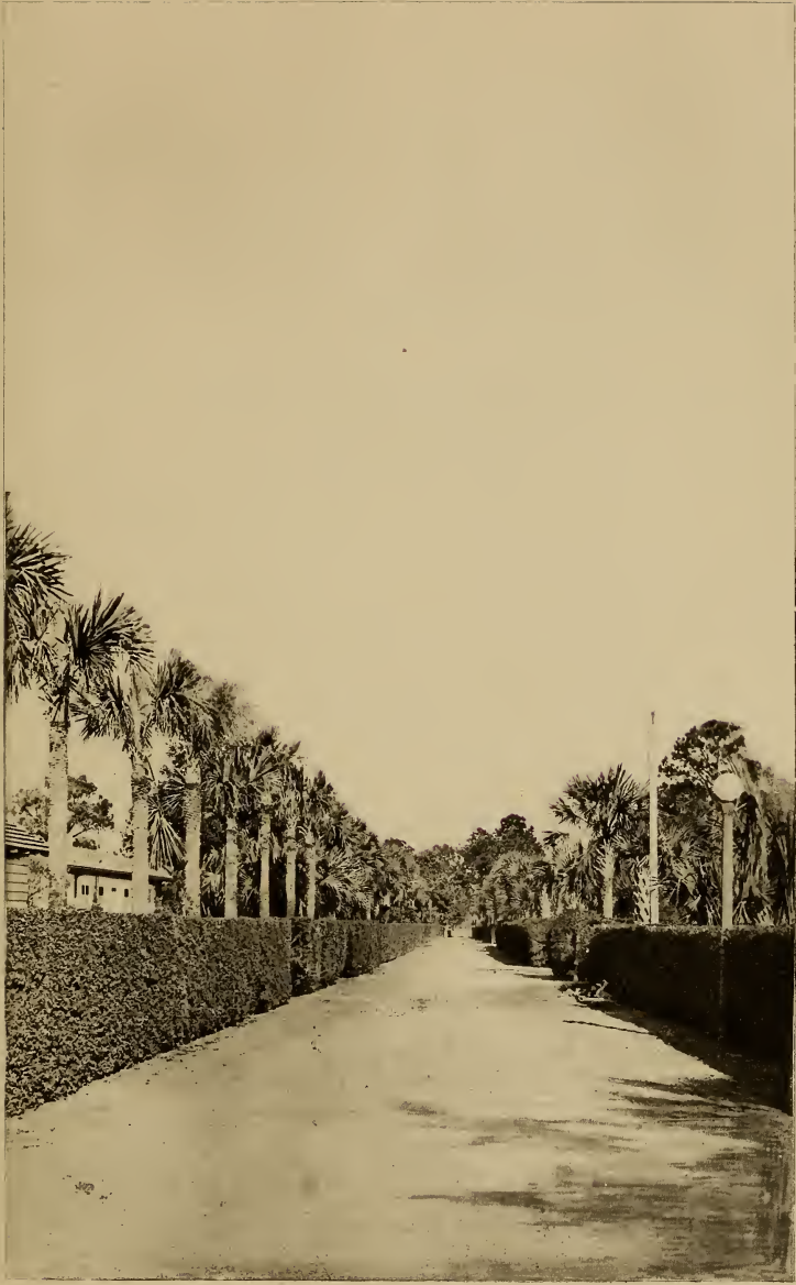
OLD PLANTATION ROAD